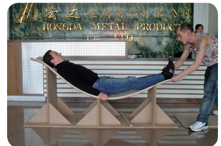
Testing the precision of the 3D design during prototyping.