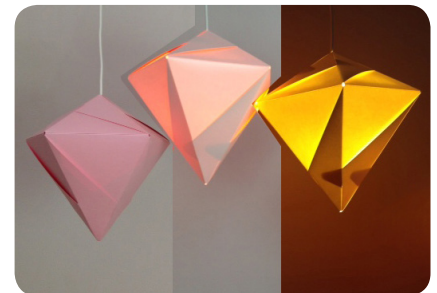
Pastel in the daylight, the colours intensify with darkness.