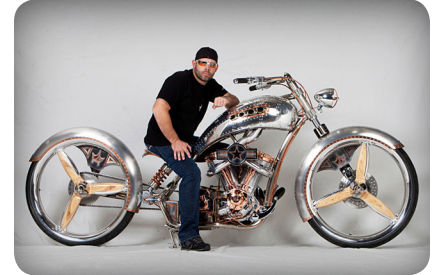
Paul Teutul, Jr. on the winning bike in the American Chopper Build-off .

"I have to give your program credit. It's so easy to use and so quick. For designing suspension stuff like what I'm doing, it's like being able to sketch. It's just really, really good for doing that because I can do stuff so quickly and make changes. So it really helped when we were making it."